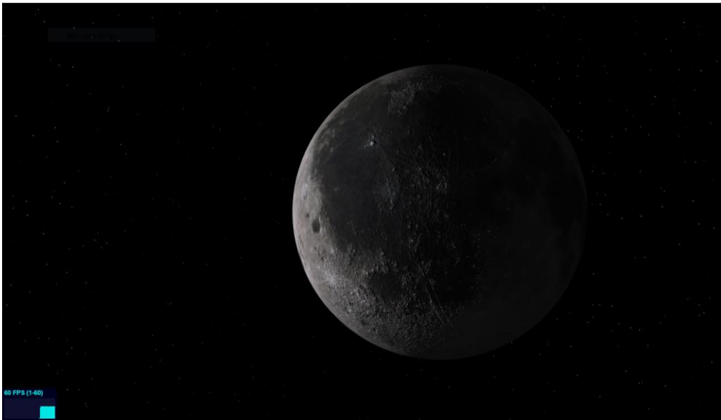
Figure 2: Screenshot from Moon Demo (Cory Gross)

Students will focus their efforts into three specific areas: