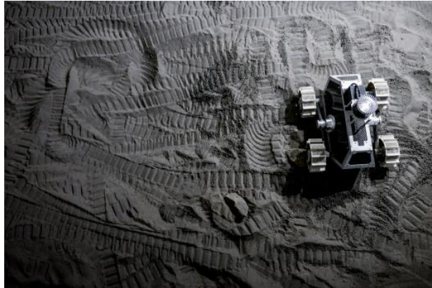
MAPP being tested at Colorado School of Mines' Lunar Testbed Facility