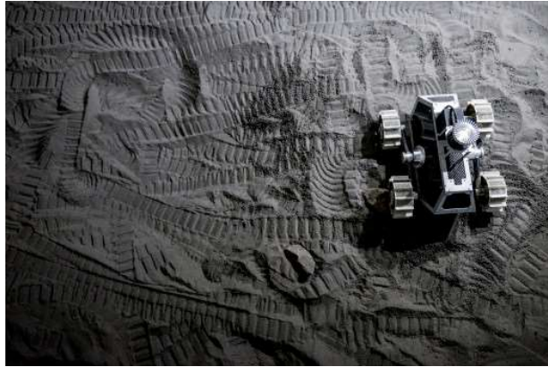
MAPP being tested at Colorado School of Mines' Lunar Testbed Facility