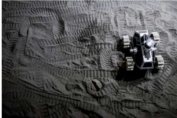
MAPP being tested at Colorado School of Mines' Lunar Testbed Facility